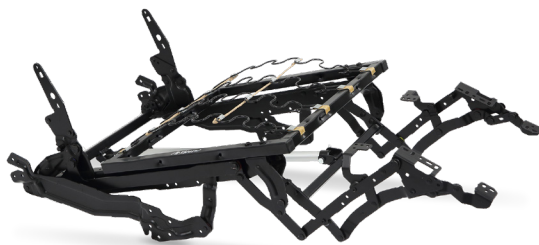
3506 One-Motor Mechanism

CloudZero ® Cinema Mechanism (One- or Two-Motor)